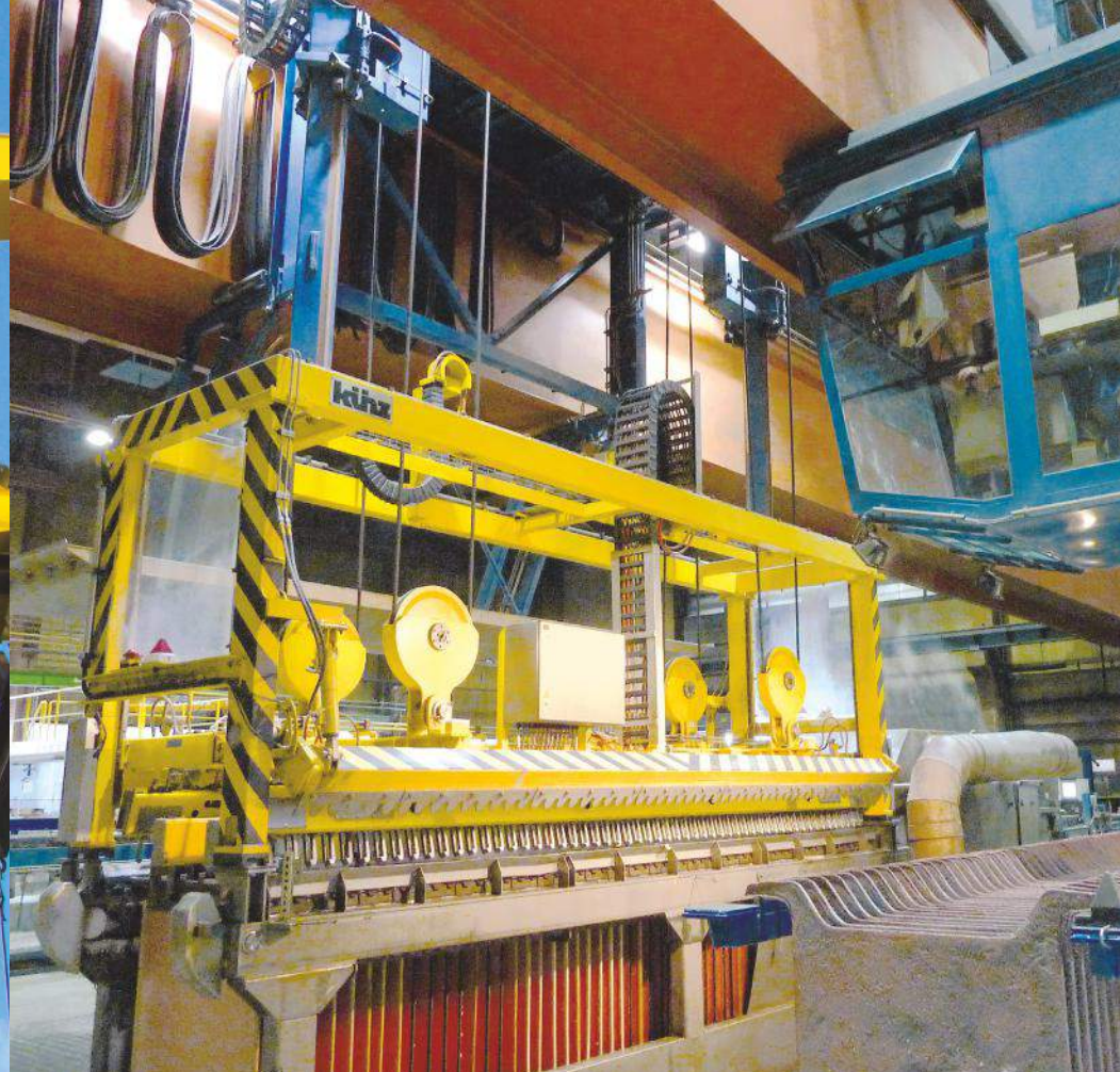
Refurbished Kuenz crane, Brixlegg Copper Refinery, Austria