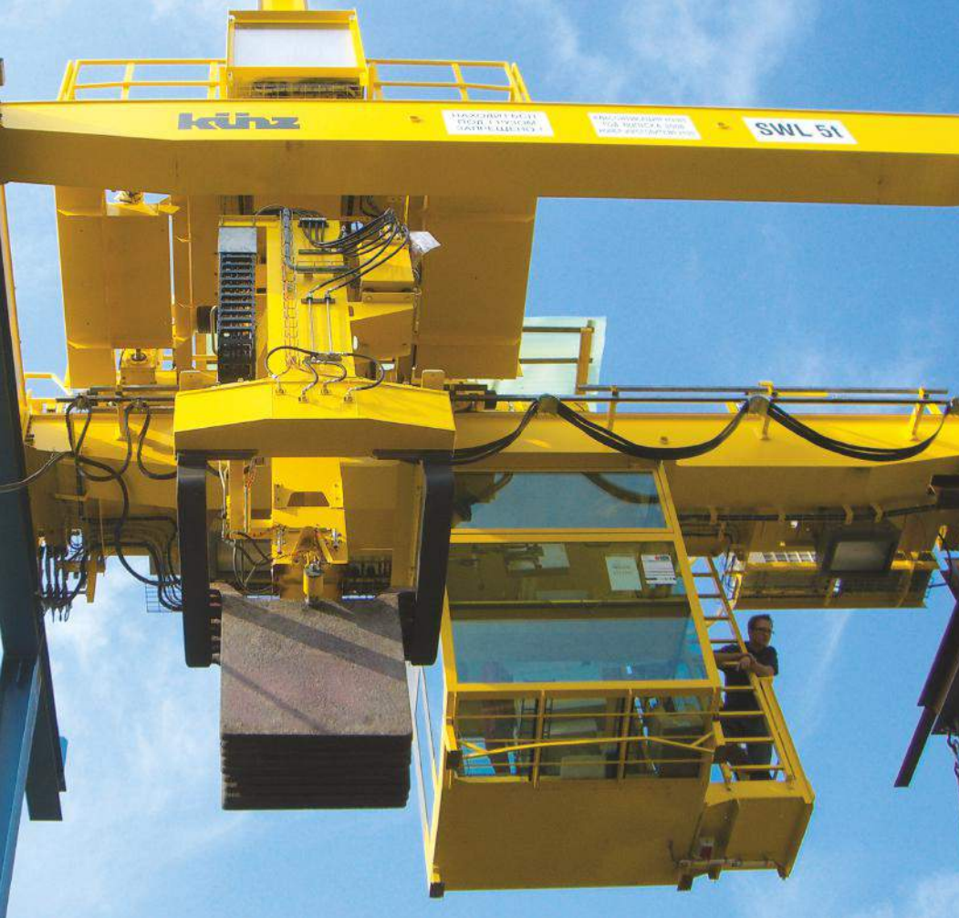
Anode handling crane, Kazzinc JSC Copper refinery, Kazakhstan