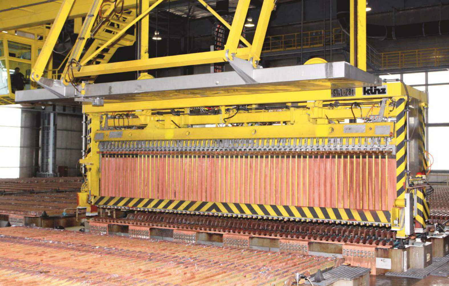
Aurubis Bulgaria AD Copper Refinery in Pirdop, Bulgaria