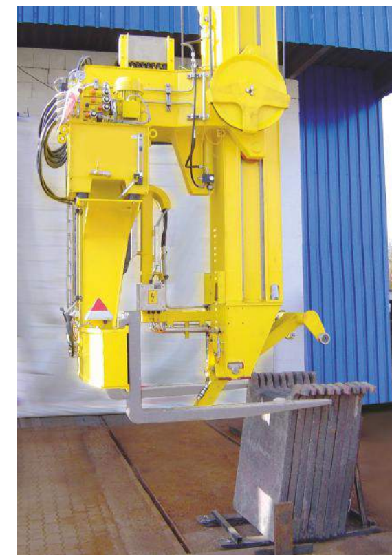
Handling of anodes