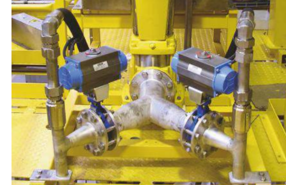
Contact washing system