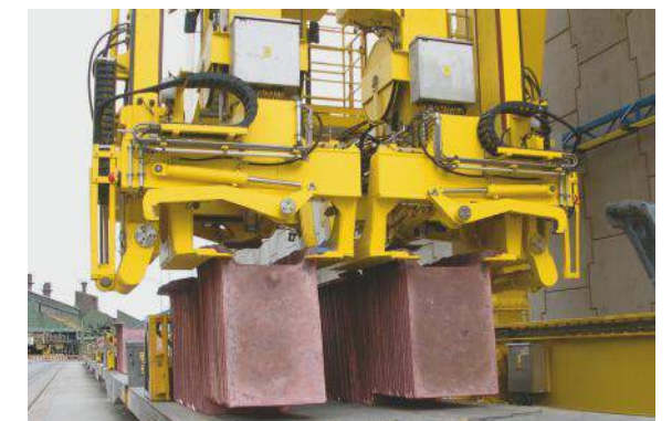
Discharging of anodes