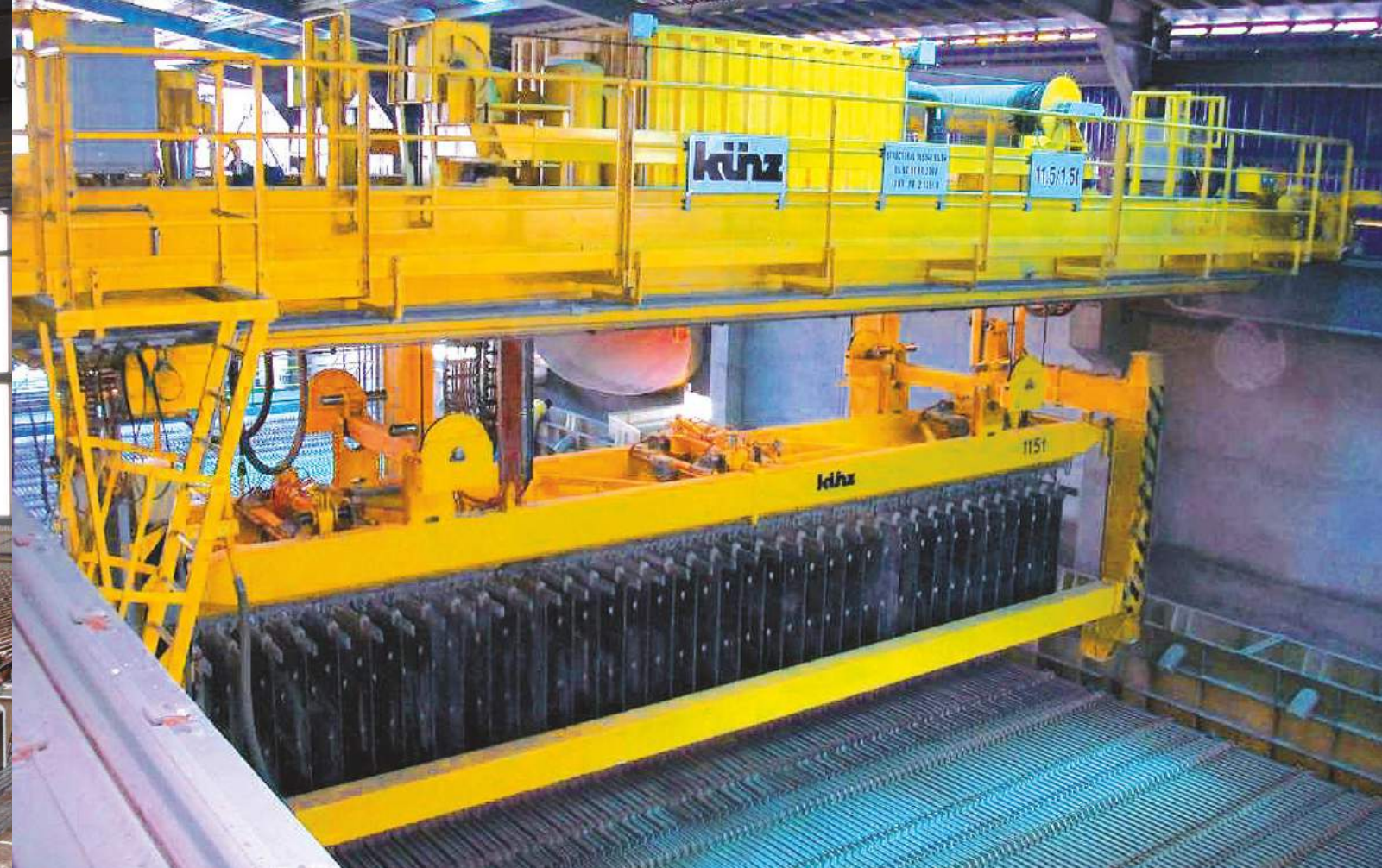
Hindustan Zinc Ltd. Zinc Refinery in Chittorgarh, India

Site features are the deciding factor as to which technology will be used.