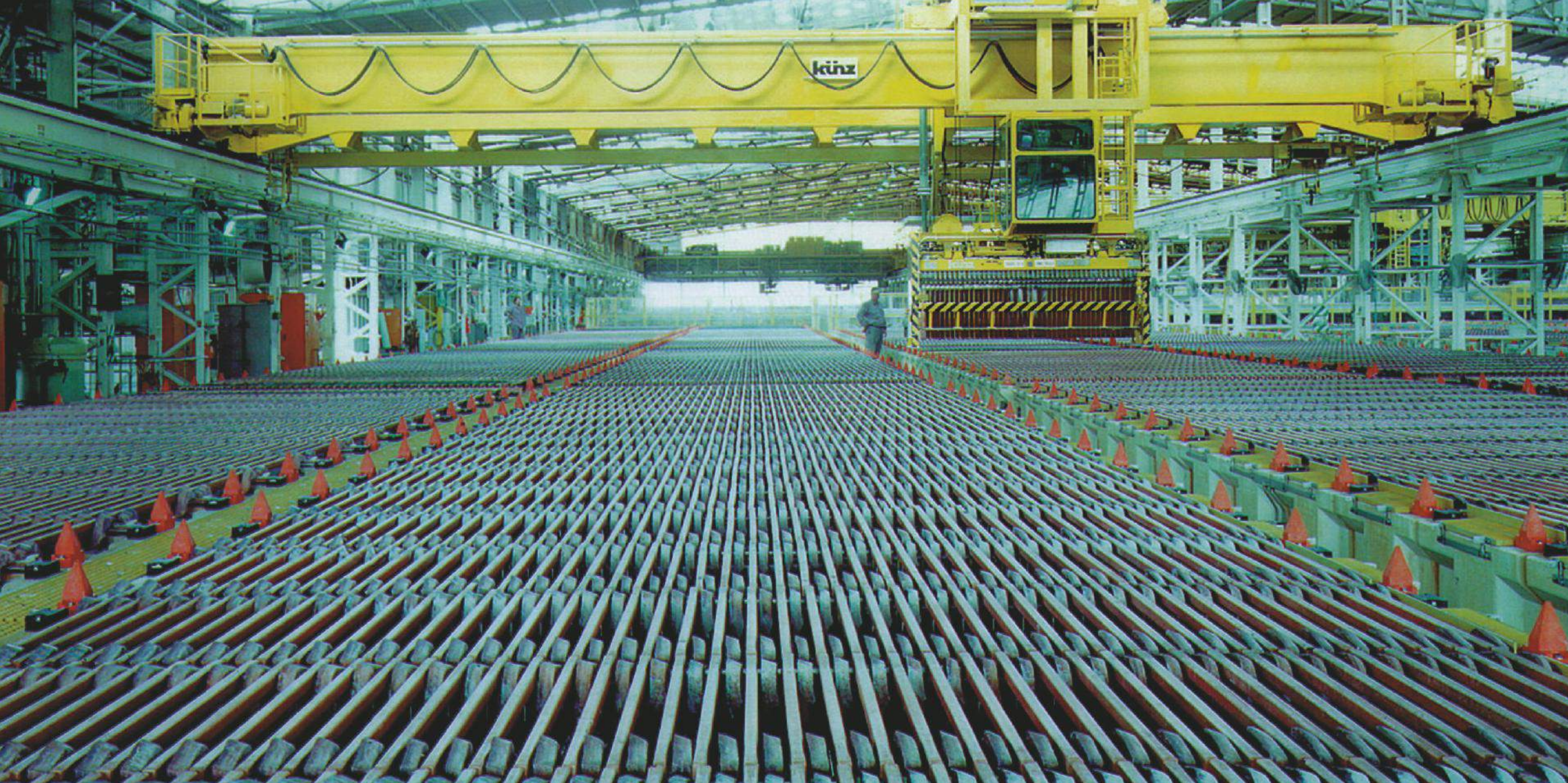
Accurate handling of anodes and cathodes shown at Copper Refineries PTY Ltd., Townsville, Australia