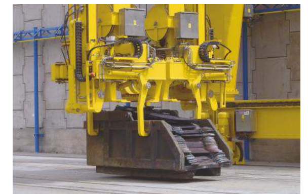
Handling of scrap containers