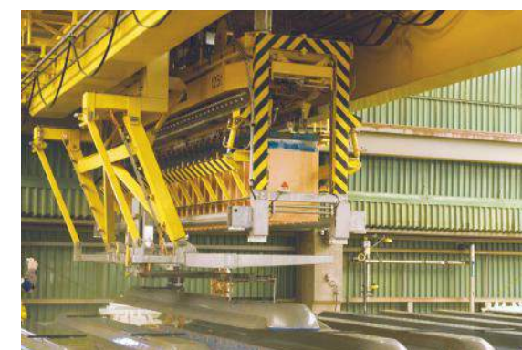
Cell cover lifting system

Fast crane cycles together with integrated safety features ensure high productivity of the handling process