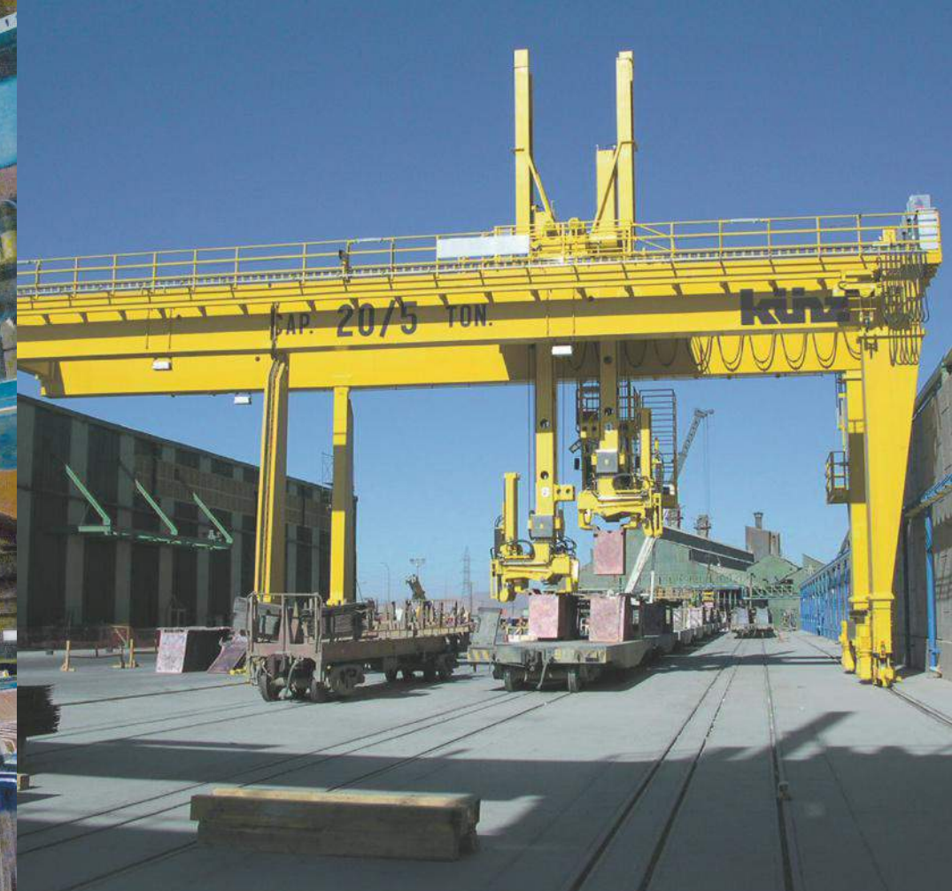
Crane for cathode, anode and scrap container handling, Codelco, Chile

Upgrade your product handling efficiency by intelligent step by step refurbishment and optimize handling processes outside the tankhouse.